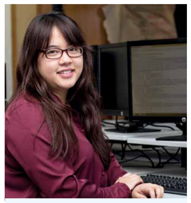
"I enjoy the practical experiences the programme includes."

Growing your digital skills is easy and free at Ara Connect. Study at your own pace and fit your learning around work, family and other commitments.